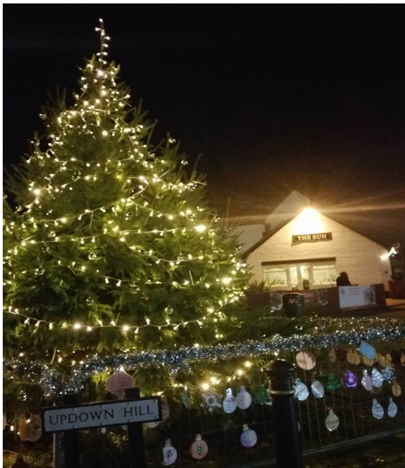
Windlesham Village Centre