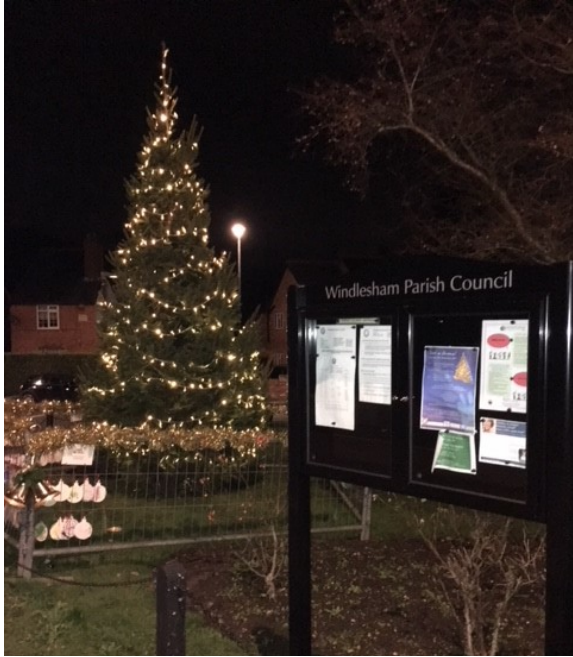
Lightwater Village Centre